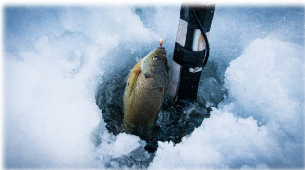
Figure 6. Ice fishing.

The Boundary Waters Canoe Area Wilderness is the only large temperate lake-land wilderness in the National Wilderness Preservation System and is renowned for its water-based recreational opportunities. Great glaciers repeatedly scraped and gouged this area over the past 2 million years, leaving behind rugged cliffs and crags, gentle hills, shorelines of exposed bedrock, sandy beaches, and an abundance of rivers and lakes dotted with islands (figure 7 and figure 8). With several hundred miles of streams and over 1,000 lakes, approximately 190,000 acres (20 percent) of the surface area of the Boundary Waters Canoe Area Wilderness is water. This network of connecting water bodies provides unique opportunities for long distance travel by watercraft—a rare experience within the continental United States.