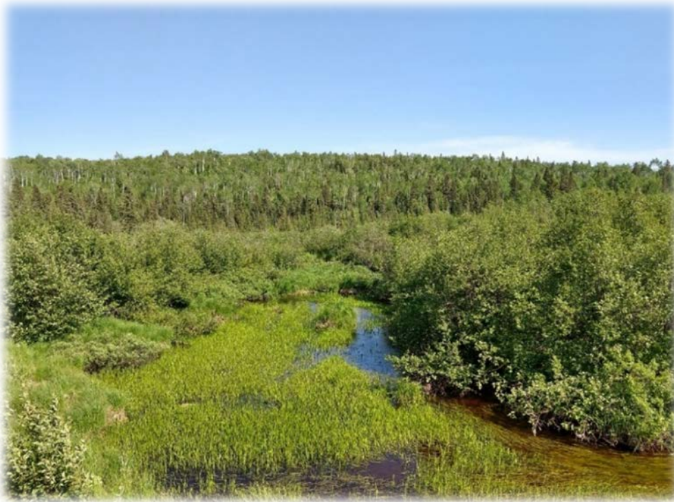
Figure 4. Creek and wetland.

Wetlands are an ecologically important component of the landscape and provide numerous ecological services including water storage and diverse habitat for flora and fauna. The wetlands on the Superior National Forest are forested with varying degrees of connection to local or area groundwater (figure 4). “The Rainy River-Headwaters watershed occurs entirely within the Mixed Wood Shield Ecoregion. Wetland condition in this ecoregion is very good, especially when compared to other ecoregions in the state. Based on plant community floristic quality, 84 percent of the wetlands in the Mixed Wood Shield Ecoregion are estimated to be in Exceptional or Good condition and an estimated 0 percent are in Poor condition” (Mielke 2017).