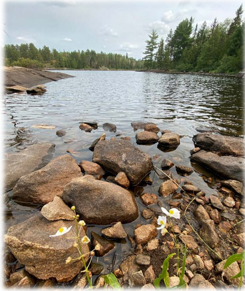
Figure 9: Dispersed campsite in wilderness.

There are 76 camping areas within the withdrawal application area boundary, including 12 developed campgrounds. These sites range from the more developed (electric hook-ups, canoe rentals) that may be reserved online to smaller, more rustic areas that are first come, first served. Most are located near lakes, trails, or other points of interest. The other camping areas are dispersed use, without facilities. Campground use is generally high, though is only known for the campgrounds that charge a fee because those campgrounds have records of use based on the fees collected. For example, Birch Lake Campground had 7,350 campers in 2020 and 8,471 in 2021; South Kawishiwi (figure 11) had 8,302 campers in 2020 and 7,897 campers in 2021.