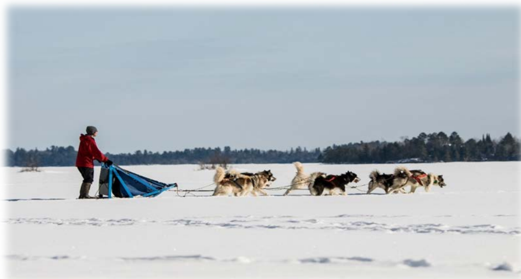
Figure 12. Dog sledding.

Recreation events that occur within the withdrawal application area boundary include a bicycle race, a snowmobile fun run, an all-terrain vehicle cancer fundraiser, the Wolf Track Classic Sled Dog Race, the Ely Marathon, and a rubber duck race. Outfitter-guide permitted activities in the application boundary include canoeing, fishing, hunting, winter camping, dogsledding (figure 12), educational activities, and livery services.