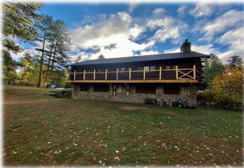
Figure 11. Historic South Kawishiwi Campground pavilion.