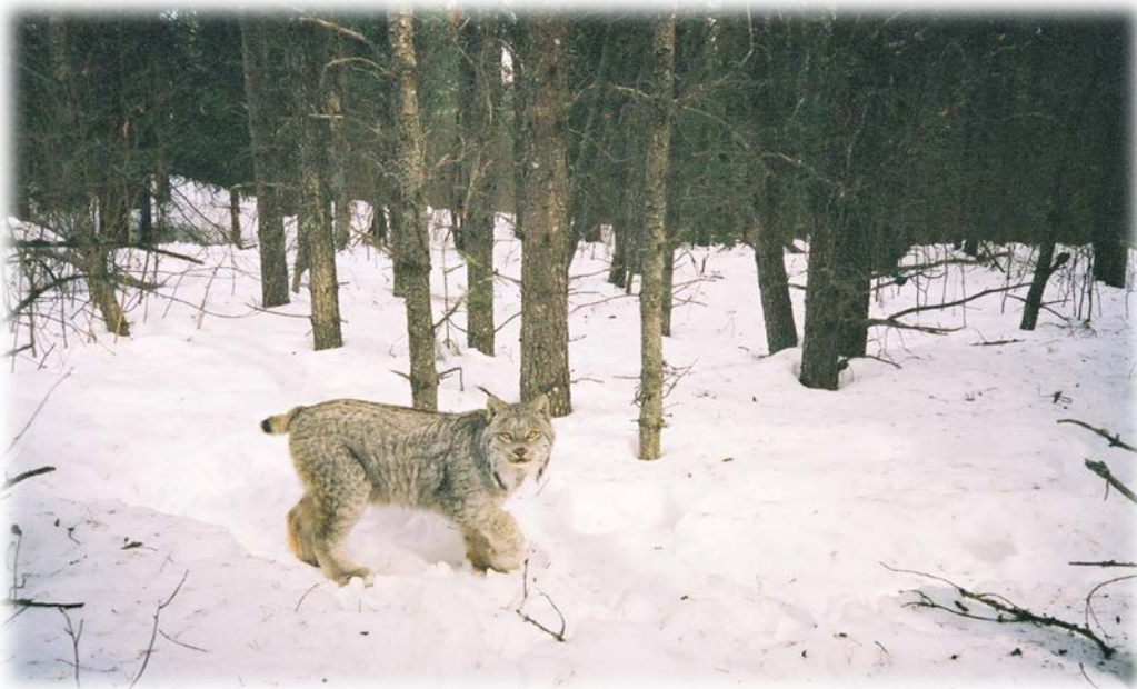
Figure 15. Canada lynx.