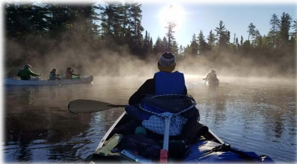
Figure 5. Fog canoeing.