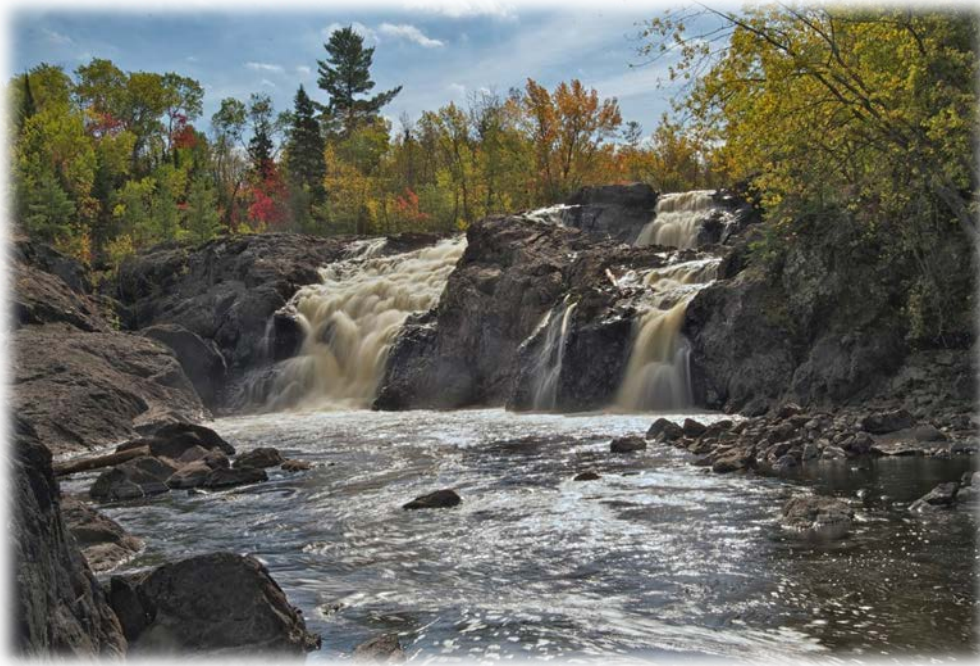
Figure 10. Kawishiwi waterfall.