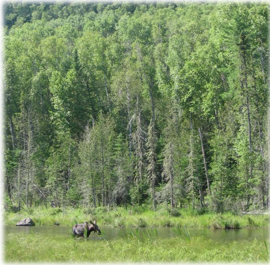
Figure 16. Moose.