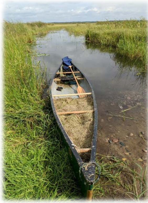
Figure 3. Manoomin collected by canoe.

Wild rice ( Zizania palustris ) is a culturally and biologically important annual wetland plant that occurs in a variety of lakes and rivers within the withdrawal application area (Minnesota Tribal Wild Rice Task Force 2018). This grass grows in shallow freshwater in marshes, fringes of lakes and rivers and typically grows in depths 0.5 to 3 feet (figure 3). Wild rice ( manoomin ) is an important plant to the Ojibwe people for sustenance, foundational to their cultural identity, and a reserved treaty right (further addressed in the Tribal Traditional Needs and Values Report). Approximately 99 waterbodies within the withdrawal area boundary support populations of wild rice, in addition to Fall Lake, Newton Lake, and Basswood Lake located downstream of the withdrawal application area.