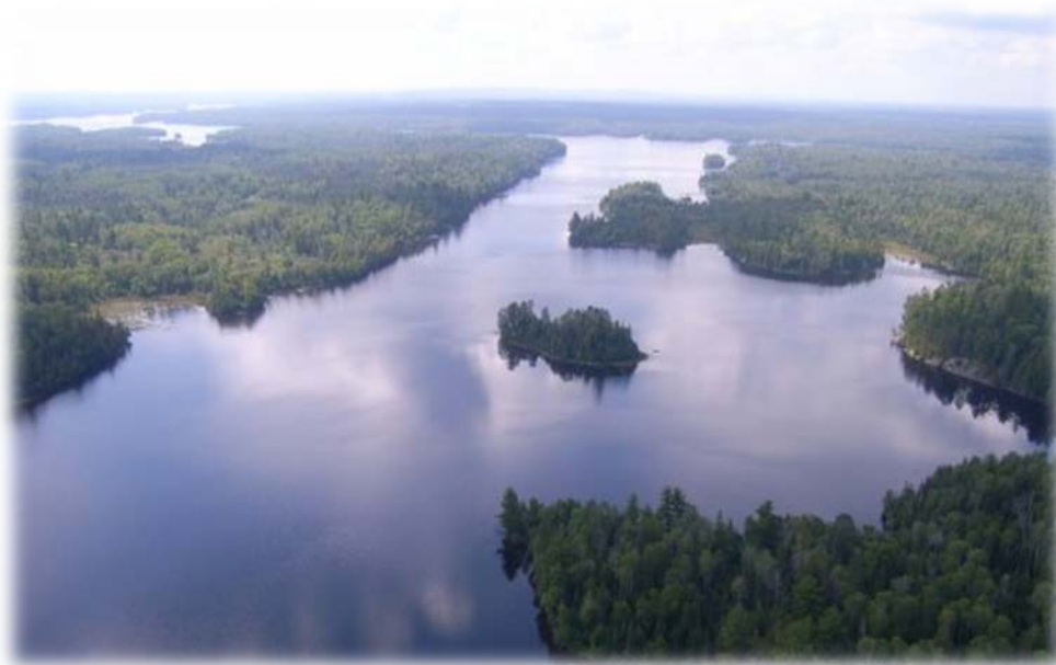
Figure 7. Kawishiwi River.