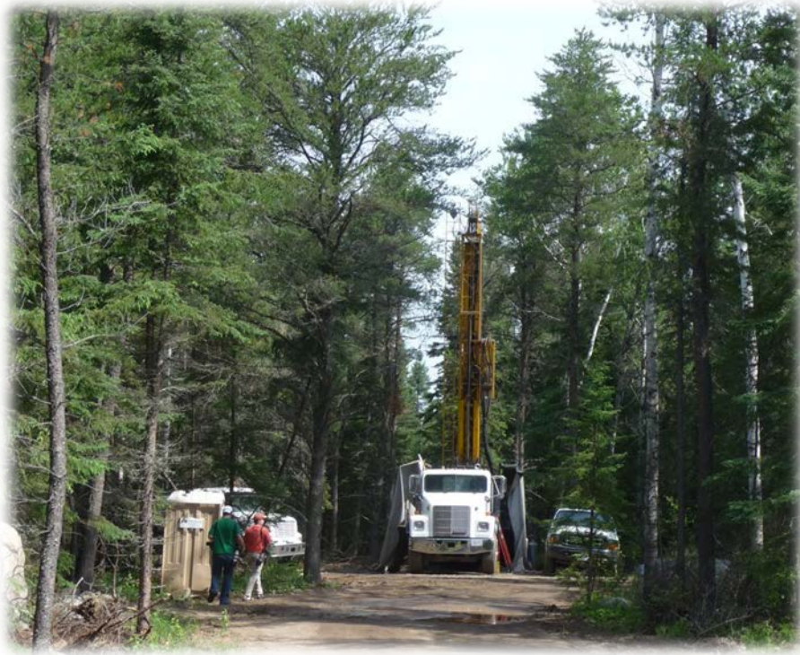
Figure 2. Exploration drilling.

Individuals, organizations, and families from within and outside of the local region value the withdrawal application area for its contributions to livelihoods and their cultural heritage. People agree that the area requested for withdrawal contains many resources that sustain a way of life and tie people to historical uses of the land. These activities and areas provide connections to the past and a sense of identity. Interested members of the public shared a deep sense of concern for how future management would affect their values, heritage and livelihoods.