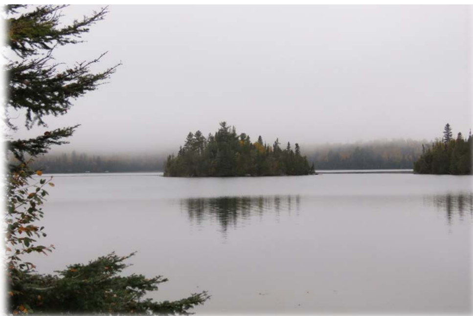
Figure 8. Lake with an island.