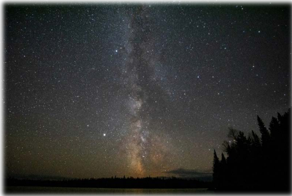
Figure 13 . Night sky at Poplar Lake.

The soundscape of the wilderness and the withdrawal application area is composed of a mix of natural and human-generated sounds. However, the withdrawal application area and the wilderness provides a predominantly natural soundscape where a very quiet environment may be enjoyed by the public.