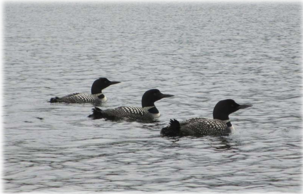
Figure 14. Loons in a row.

Lands within the withdrawal application area and the adjacent Boundary Waters Canoe Area Wilderness provide diverse habitat for thousands of breeding, wintering, and migratory species of terrestrial wildlife including over 350 species of birds, mammals, reptiles, amphibians, and thousands of species of invertebrates. Canada lynx, gray wolf, and the northern long-eared bat, species designated as “threatened” under the Endangered Species Act, are known to occur within the withdrawal area. Critical habitat for Canada lynx and gray wolf overlaps the entire withdrawal application area.