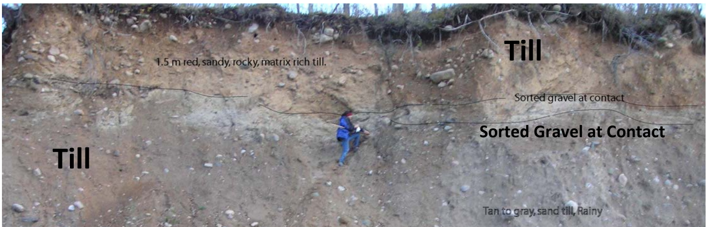
FIGURE 7 – Photos of Potential Groundwater Conduits at Embarrass and Dunka Mines

Data source: Supplemental materials included with Jennings, C.E. and Reynolds, W.K., 2005, Surficial geology of the Mesabi Iron Range, Minnesota: Minnesota Geological Survey Miscellaneous Map M-164, scale 1:100,000.